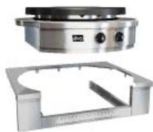
30G Trim Kit Countertop Cutout 11-0123-ATK